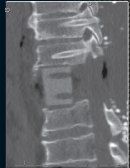
CarboClear® VBR: CT